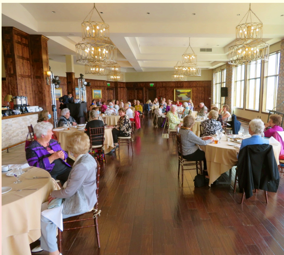
Our appreciative luncheon audience at capacity. You all looked SO MARVELOUS!!